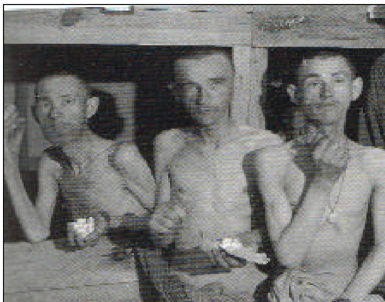
Survivors of the concentration camps eating sugar, May 1945